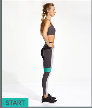
Secure band around both legs just above knees. Stand with feet hip-width apart and hands on hips.