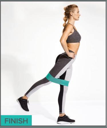
Keeping body straight and head up, slowly lift exercising leg up and back with toes pointed toward floor. Hold 1-2 seconds and return to start position.