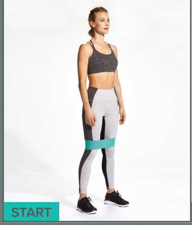
Secure band around both legs just above knees. Stand with feet hipwidth apart and arms straight at sides.