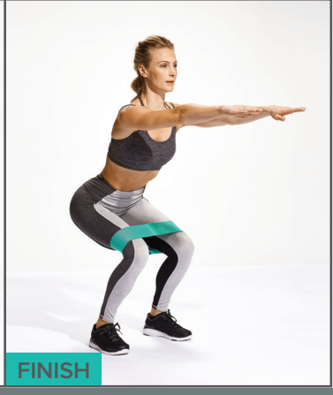
Slowly raise arms while bending knees, lower hips and buttocks until arms are straight out in front and knees are directly above toes. Hold 1-2 seconds and return to start position.