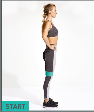
Secure band around both legs just above knees. Stand with feet hipwidth apart and hands on hips.